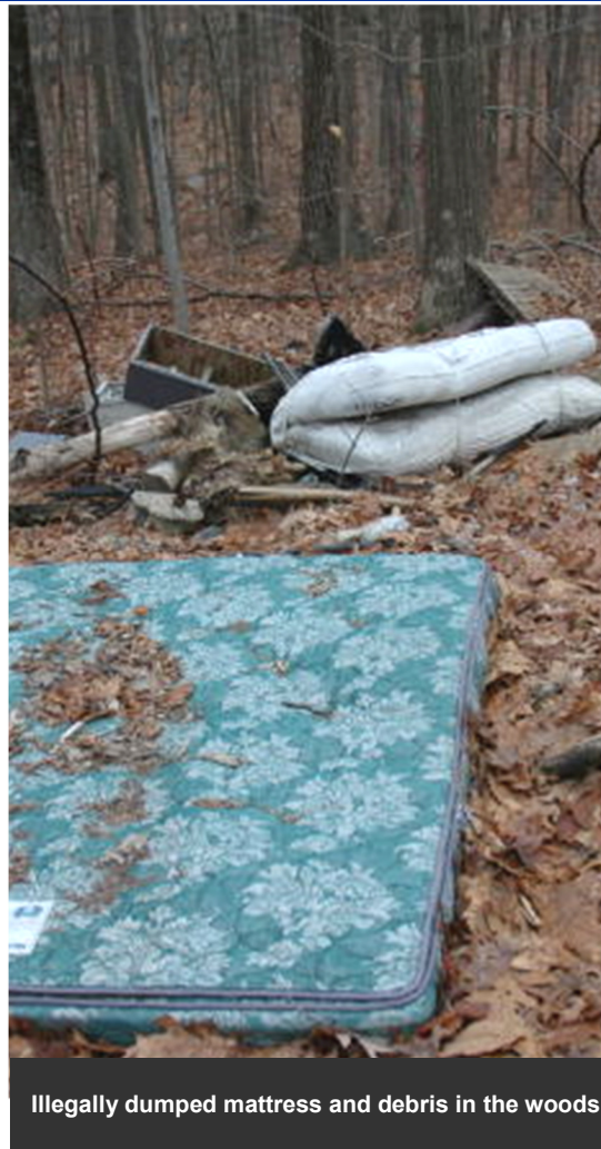
Illegally dumped mattress and debris in the woods.