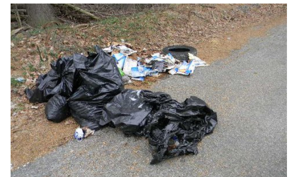
Household garbage dumped illegally on the side of a road.

This pamphlet and the information contained herein shall not constitute legal advice and should not be relied upon in lieu of consultation with the appropriate legal advisors. In addition, the contents of this pamphlet are not intended to supersede, abridge or alter the regulations set forth by the New Jersey Department of Environmental Protection (NJDEP).